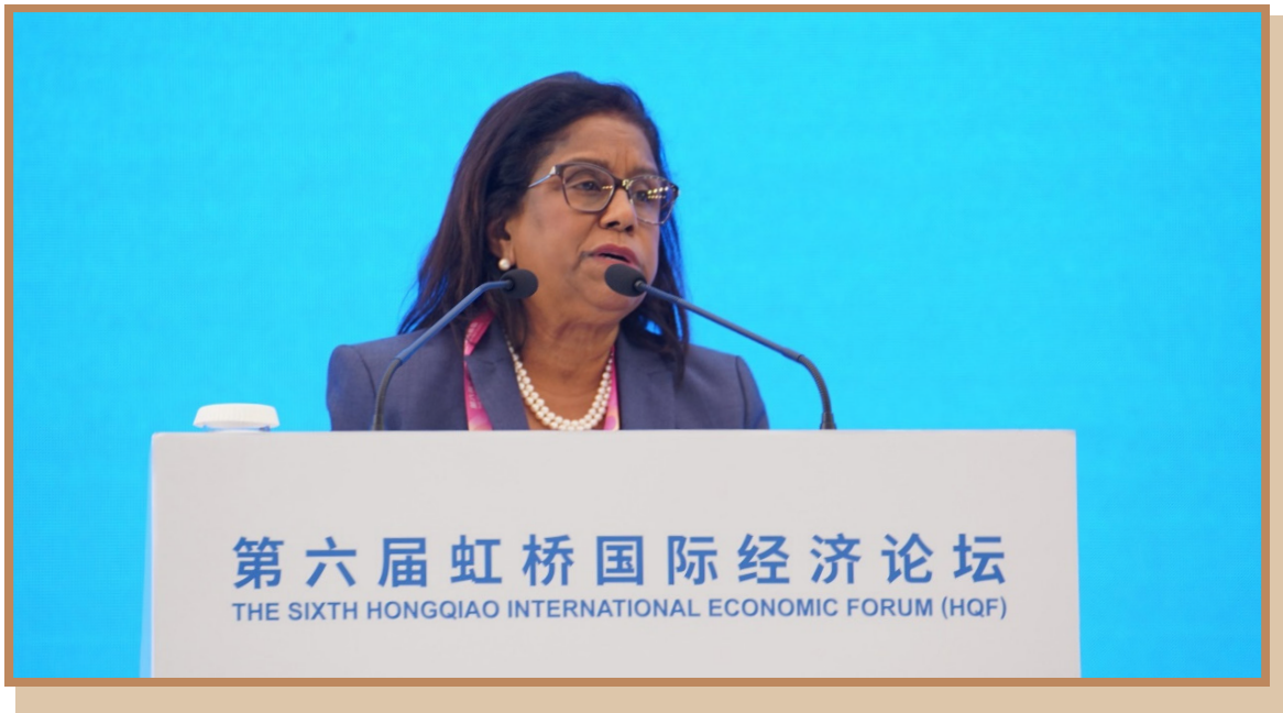
Paula Gopee-Scoon, Senator and Minister of Trade and Industry of Trinidad and Tobago, addressed the Parallel Session on Agricultural Services Trade: Growth, Opportunities and Resilient Global Supply Chains in Shanghai

Paula Gopee-Scoon, Senator and Minister of Trade and Industry of Trinidad and Tobago, stated that Trinidad and Tobago has implemented policies such as significantly enhancing agricultural technology and promoting digital transformation to reduce dependence on imports, ensure food security, and promote sustainable agricultural development. She expressed the hope to further strengthen agricultural services trade cooperation with China and enhance agricultural production capacity.