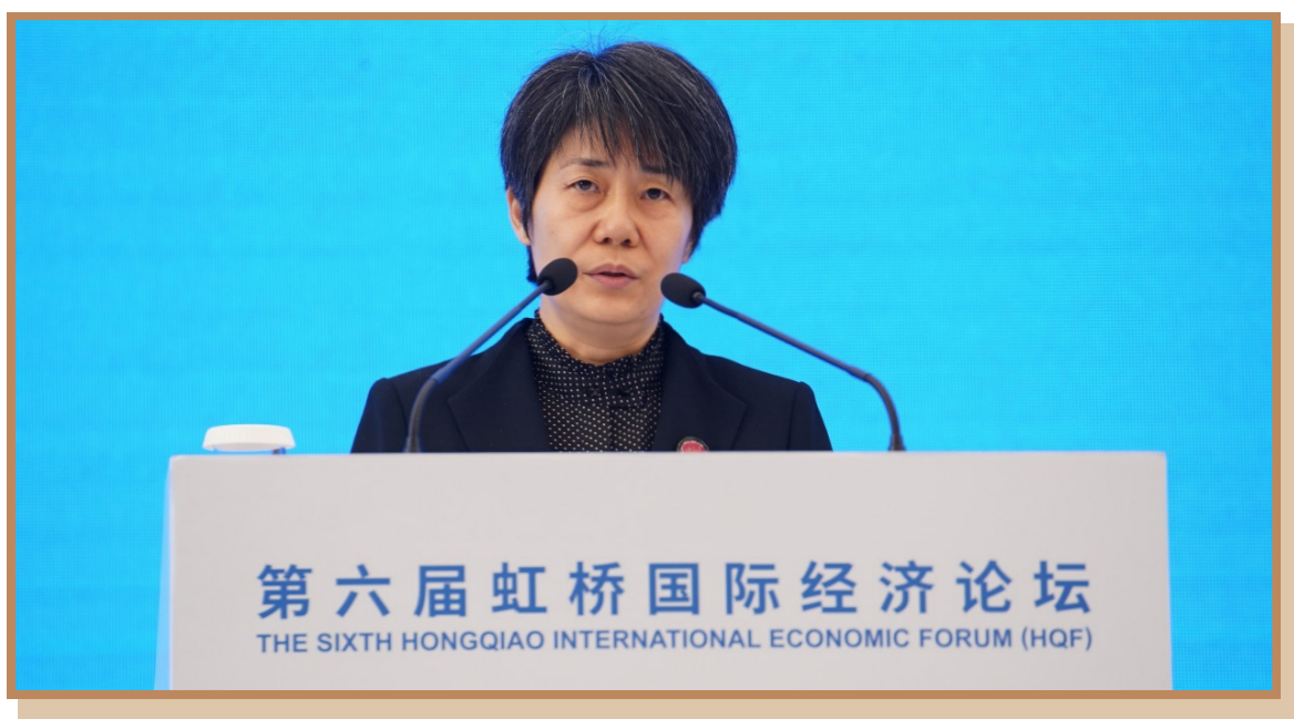
Guo Tingting, Vice Minister of the Ministry of Commerce of China, addressed the Parallel Session on Agricultural Services Trade: Growth, Opportunities and Resilient Global Supply Chains in Shanghai

Guo Tingting, Vice Minister of the Ministry of Commerce of China, expressed that emerging technologies and services are injecting new vitality into the development of agricultural services trade, while green and low-carbon goals create new value. Extensive and in-depth international cooperation needs provide new directions for the development of agricultural services trade. The Ministry of Commerce of will closely collaborate with the Ministry of Agriculture and Rural Affairs and other departments to build a high-level open platform, deepen bilateral and multilateral agricultural trade cooperation, and create a favorable international development environment for agricultural services trade.