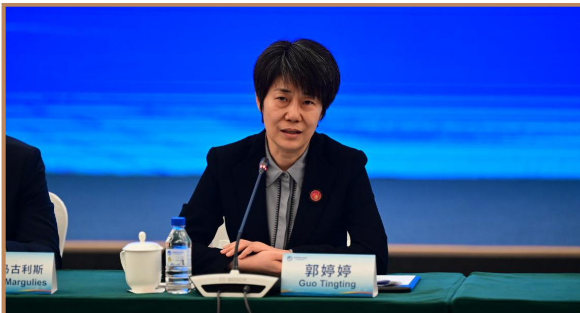
Guo Tingting, Vice Minister of the Ministry of Commerce of China, addressed the Parallel Session on China's High-Quality Development and New Opportunities for U.S. Companies in Shanghai