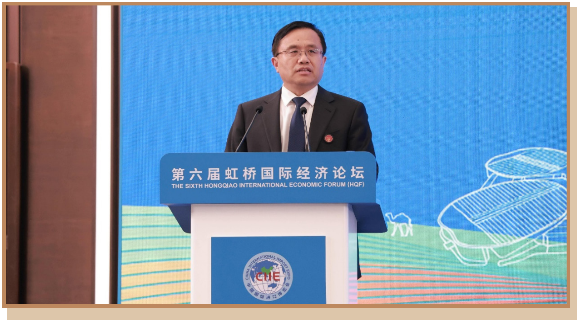
Song Junji, Vice Governor and Secretary-General of Shandong Provincial People's Government, attended the Parallel Session on Regional International Organization Demonstration Area: New Platform and New Practice of Belt and Road International Cooperation in Shanghai and moderated addresses and keynote speeches