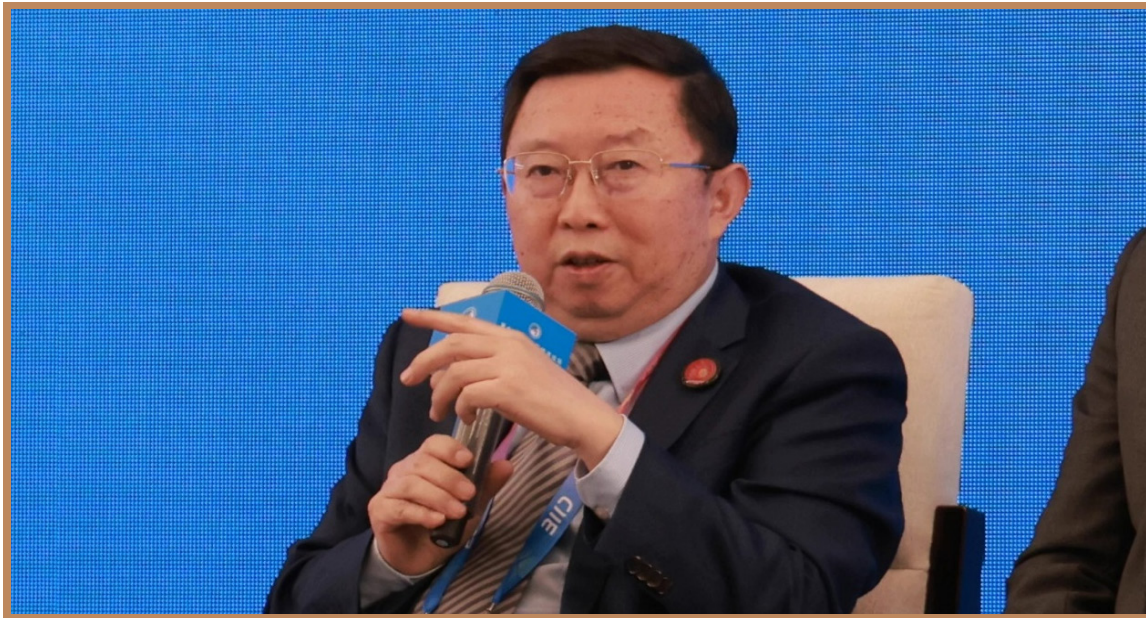
Xu Ningning, Chairman of the RCEP Industry Cooperation Committee and Executive President of the China-ASEAN Business Council, attended the Parallel Session on Regional International Organization Demonstration Area: New Platform and New Practice of Belt and Road International Cooperation in Shanghai and participated in Dialogue Salon section

Xu Ningning, Chairman of the RCEP Industry Cooperation Committee and Executive President of the China-ASEAN Business Council, suggested that the construction of the China-ASEAN Free Trade Area should emphasize five combinations: 1) combine high relevance with strong economic and trade complementarity, making it easier for countries with stronger complementarity in pillar industries to cooperate and promote; 2) combine government cooperation mechanisms with industry and business cooperation mechanisms; 3) combine national industry and commerce associations with local governments; 4) combine free trade agreements with industrial cooperation; 5) combine the construction of regional international cooperation platforms with independent opening-up. Establishing mechanisms and platforms to better enable demonstration areas to assume an increasingly active role in regional economic integration.