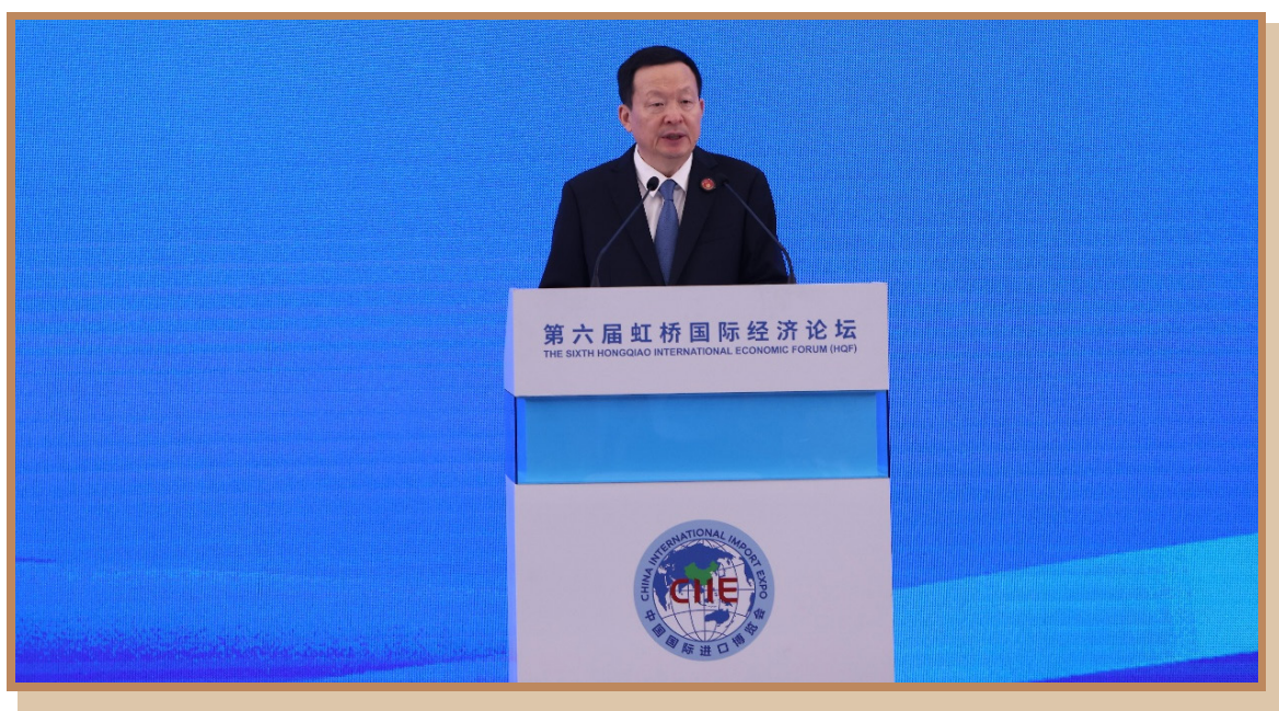
Zhou Naixiang, Governor of Shandong Province, addressed the Parallel Session on Regional International Organization Demonstration Area: New Platform and New Practice of Belt and Road International Cooperation in Shanghai

Zhou Naixiang, Governor of Shandong Province, pointed out that Shandong Province is earnestly implementing President Xi Jinping's important instructions, aiming to "take the lead and open up new prospects". Through steady and solid efforts, the province is deeply implementing the major national strategies for ecological protection and high-quality development in the Yellow River basin. Shandong is cohesively advancing the construction of a leading area for green, low-carbon and high-quality development, and actively building open development platforms such as the China-SCO Local Economic and Trade Cooperation Demonstration Area (SCODA) and the starting areas for the transformation of old and new driving force in Jinan. It is accelerating the construction of a strong modern socialist province in the new era, and the economic development is showing a favorable trend of stable and robust growth. On the new journey of promoting high-quality Belt and Road cooperation, Shandong is willing to work hand in hand with all parties to deepen practical cooperation, share the fruits of development, and contribute more to building an open world economy.