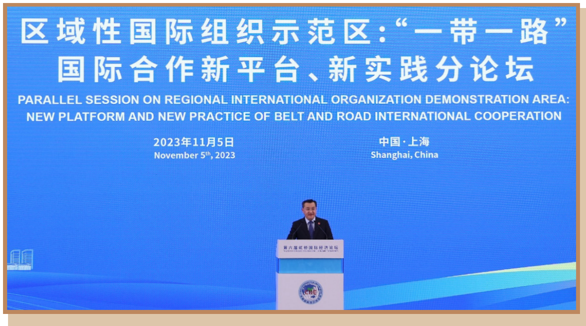
Li Fei, Vice Minister of the Ministry of Commerce of China, addressed the Parallel Session on Regional International Organization Demonstration Area: New Platform and New Practice of Belt and Road International Cooperation in Shanghai

Li Fei, Vice Minister of the Ministry of Commerce of China, noted out that against the backdrop of the continuous surge of “anti-globalization” sentiments and increasing trade protectionism, China has consistently advocated and promoted an open world economy. It has charted a blueprint for high-quality Belt and Road cooperation and opened up new paths for countries to jointly achieve modernization. The measures include: 1) deepening cooperation within multilateral regional mechanisms, and supporting an open, free, fair, inclusive, and rule-based multilateral trading system; 2) improving the institutions for regional cooperation, optimizing the regional economic cooperation environment, and continuously enhancing the level of liberalization and facilitation of trade and investment; 3) promoting regional industrial integration and development, giving full play to the role of industrial agglomeration and radiation, and helping BRI countries to integrate into the global industrial chain, supply chain and value chain.