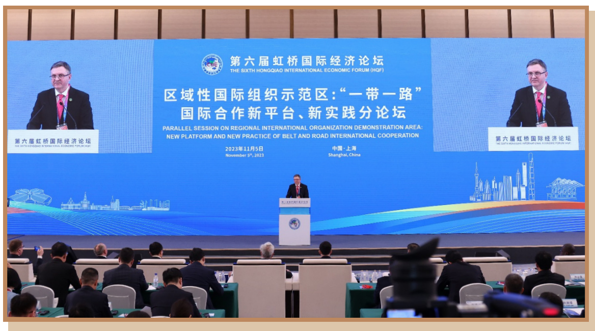
Aleksandr Chervyakov, Minister of Economy of the Republic of Belarus, addressed the Parallel Session on Regional International Organization Demonstration Area: New Platform and New Practice of Belt and Road International Cooperation in Shanghai

Aleksandr Chervyakov, Minister of Economy of the Republic of Belarus, stated that Belarus fully supports the implementation of the Belt and Road Initiative (BRI) and the initiatives for global development, global security, and global civilization. Economic and trade cooperation between Belarus and China is on a growing trajectory and is committed to reaching new heights. The two sides jointly established the Great Stone China-Belarus Industrial Park, which has become one of the largest infrastructure projects in the Belt and Road cooperation. Belarus is willing to engage in cooperation with an open mindset. The BRI member countries will uphold the spiritual strength, values, and standards based on mutual cooperation, friendship, and mutual respect, build a bright future and renew friendship together.