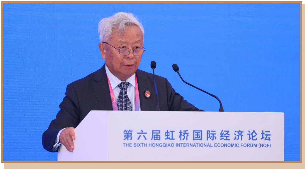
Jin Liqun, President and Chair of the Board of Directors of AIIB, attended the Parallel Session on Deepening Regional Collaborative Innovation to Empower High-quality Development of Hongqiao International Opening-up Hub in Shanghai and delivered a speech

Jin Liqun, President and Chair of the Board of Directors of AIIB, discussed the vision of AIIB and the perspective of “tomorrow’s infrastructure”. He stated that technology and digital infrastructure will be crucial drivers of sustainable growth in the coming decades. In view of Hongqiao’s role as a vital hub connecting the Yangtze River Delta with Shanghai and even global markets, he predicted that Hongqiao would not only serve as a hub for commerce and transportation but also as a hub for innovation and knowledge, driving high-quality development across economic, trade, cultural, and knowledge domains.