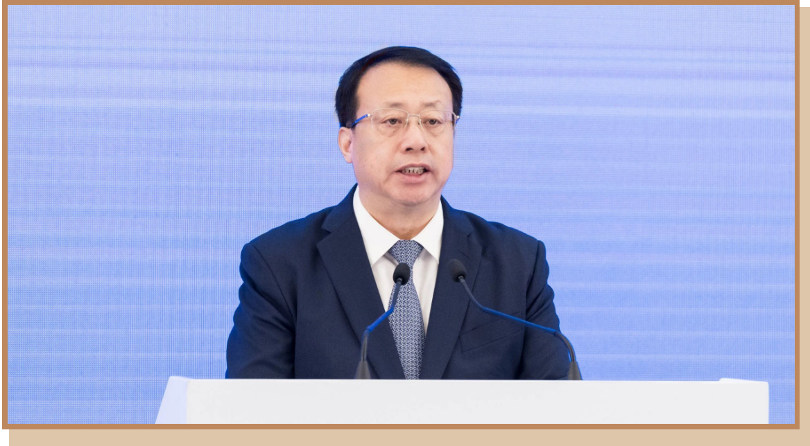
Gong Zheng, Deputy Secretary of the CPC Shanghai Municipal Committee and Mayor of Shanghai, addressed the Parallel Session on Deepening Regional Collaborative Innovation to Empower High-quality Development of Hongqiao International Opening-up Hub in Shanghai