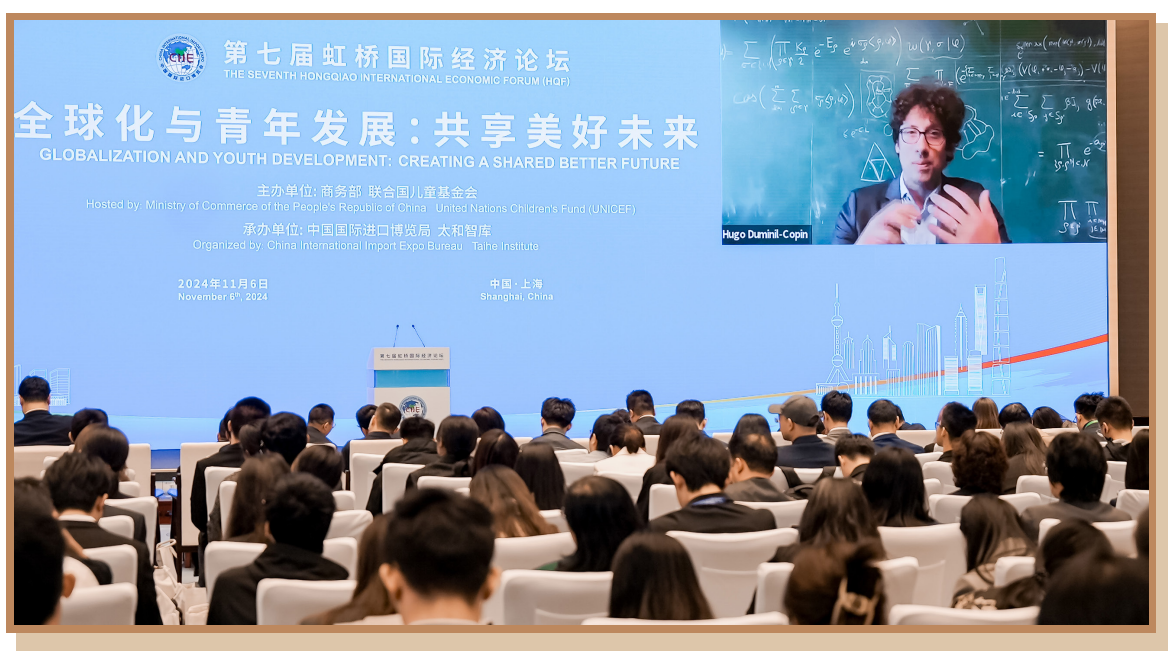
Hugo Duminil-Copin, Professor at IHES (Institut des Hautes Études Scientifiques) and the University of Geneva, Fields medalist 2022, attended via video the Parallel Session on Globalization and Youth Development: Creating a Shared Better Future and participated in Panel Discussion

Hugo Duminil-Copin, Professor at IHES (Institut des Hautes Études Scientifiques), pointed out that innovation is the result of a collaborative chain, and if any link in the chain encounters problems, the overall efficiency will decline. Therefore, both the public and private sectors should share responsibility for funding basic research, education, and development. The public sector should remain flexible and adapt to the evolving landscape of emerging technologies, creating space for interdisciplinary collaboration. The private sector, in turn, should maintain close links with the public sector through initiatives such as doctoral training programs and support for basic research. It is crucial to promote open communication across disciplinary, as the Internet era enables researchers to exchange ideas freely. Collaboration among researchers from different backgrounds, cultures, and countries significantly enhances collective intelligence and creativity.