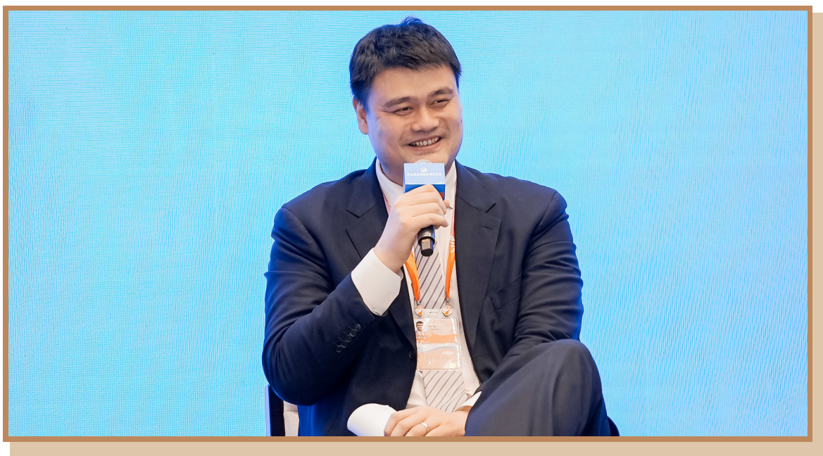
Yao Ming, Founder of the Yao Foundation and Vice President of the All-China Youth Federation, attended the Parallel Session on Globalization and Youth Development: Creating a Shared Better Future and participated in Panel Discussion

Yao Ming, Vice President of the All-China Youth Federation, stated that international exchanges among young people often revolve around shared interests and hobbies. These common interests can foster lasting communication. Young people can discover new shared passions in each other's different cultures, creating a "fission effect." For instance, sports and e-sports events provide such opportunities, while music, culture, and emerging hobbies also serve as meeting points for young people. It is important to tap into the market demand for these interests by providing platforms and venues where young people with similar passions can come together. Universities can organize sports competitions that allow young people to immerse themselves in the world of sports and its rules, and can cultivate and showcase the leadership skills of young people.