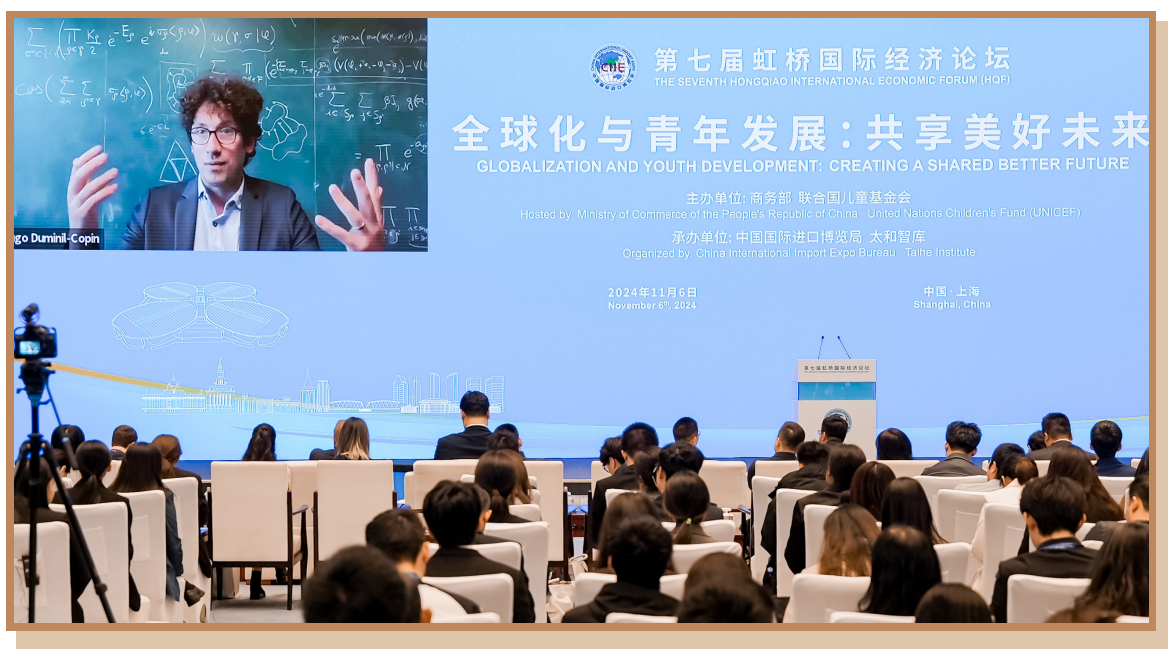
Hugo Duminil-Copin, Professor at IHES (Institut des Hautes Études Scientifiques) and the University of Geneva, Fields medalist 2022, attended via video the Parallel Session on Globalization and Youth Development: Creating a Shared Better Future and delivered a keynote speech

Hugo Duminil-Copin, Professor at IHES (Institut des Hautes Études Scientifiques), said that young people possess fearless courage and fresh perspectives that allow them to offer new points of view and ideas for solving problems. They are a driving force for technological innovation. In the context of economic globalization, governments, companies, and universities can work together to implement the following measures to fully tap the potential of youth in driving technological innovation and promoting socio-economic development: First, share knowledge as widely as possible and accelerate progress through open international scientific cooperation; second, emphasize on and support fundamental research and discipline development to strengthen the foundation of technological innovation; third, cultivate diverse research teams and encourage young researchers to travel abroad and engage in international exchanges to fully stimulate their creativity.