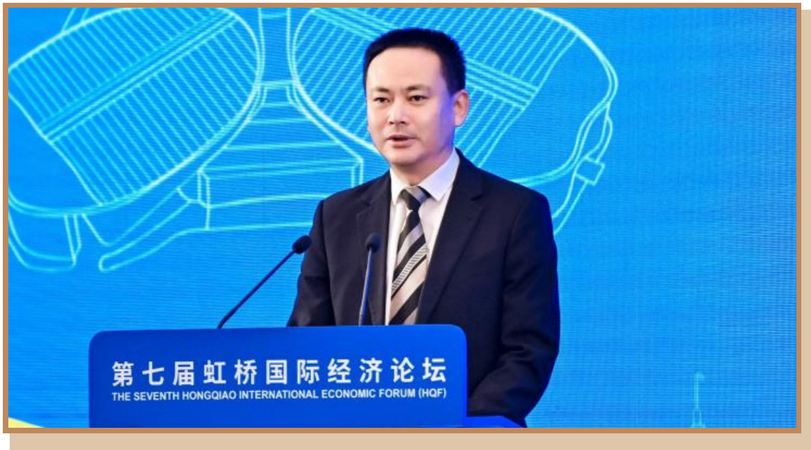
Xu Xin, Vice Mayor of Pudong New Area, attended the Parallel Session on Pudong and the World: High-Standard Institutional Opening-up for New Development Opportunities and moderated Pudong Promotion