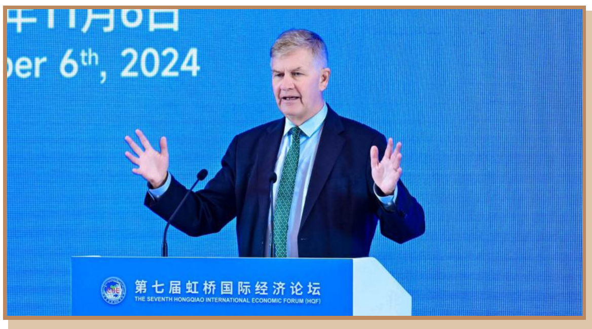
Erik Solheim, Vice President of the Belt and Road Initiative International Green Development Coalition, Former UN Under-Secretary-General, attended the Parallel Session on Pudong and the World: High-Standard Institutional Opening-up for New Development Opportunities and delivered a keynote speech

Erik Solheim, Vice President of the Belt and Road Initiative International Green Development Coalition, Former UN Under-Secretary-General, pointed out that China is now an absolute leader in green technology, where green technology is more advanced and cost-effective. Last year, China contributed $900 billion worth of sustainable energy. Pudong is also a leader in the development of green technology. Shanghai and Pudong should continue to play a leading role in green development, to be a model for China and other countries in sustainable development and a leader in the development of green cities.