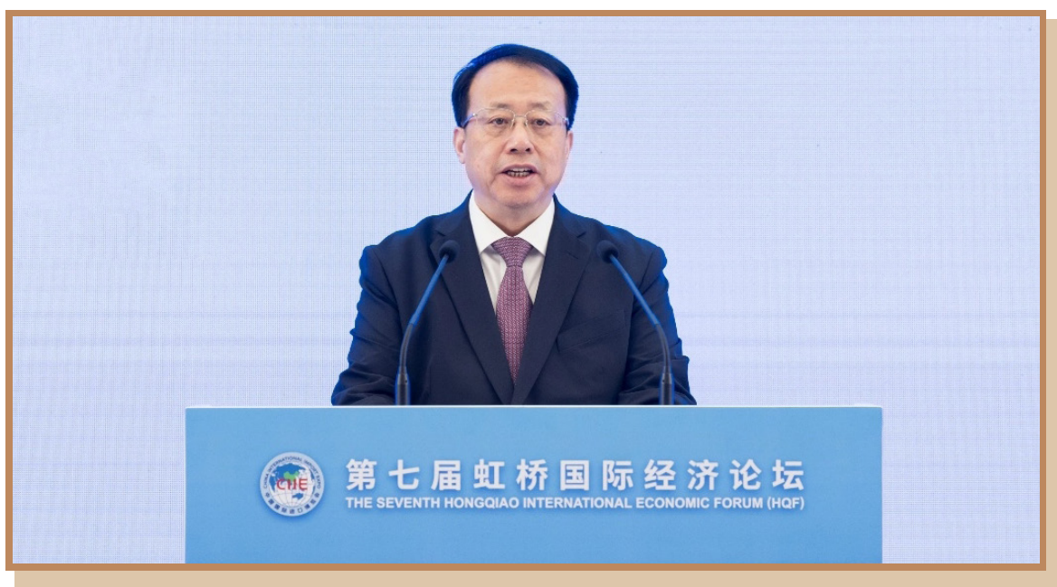
Gong Zheng, Mayor of Shanghai, addressed the Parallel Session on Pudong and the World: High-Standard Institutional Opening-up for New Development Opportunities

Gong Zheng, Mayor of Shanghai, pointed out that as the core area for the construction of the five centers, Pudong will adhere to the unity of reform and opening-up, more effectively coordinate openness and security, steadily expand high-level institutional opening, and better pilot systems, test pressures, and explore new paths for the country, striving to be a pioneer in higher-level reform and opening-up. First, we must continue to conduct stress tests, closely align with national strategic needs and the practical requirements of enterprises, actively align with international high-standard trade and economic rules, and accelerate the construction of a policy and institutional system with international competitiveness. Second, we must continue to relax market access, adhere to equal treatment, significantly reduce access restrictions on private and foreign capital, and effectively stimulate the vitality of various business entities. Third, we must continuously make efforts in maintaining a market-oriented, law-based, and internal business environment.