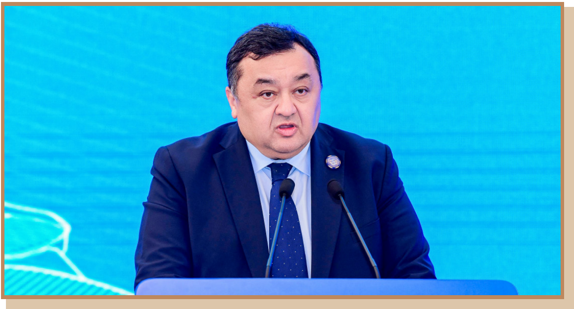
KASIMOV Izat Ablakhatovich, deputy minister of Investment, Industry and Trade, attended the parallel session on "Compliance and Sustainable Development for Global Manufacturing" and delivered a speech