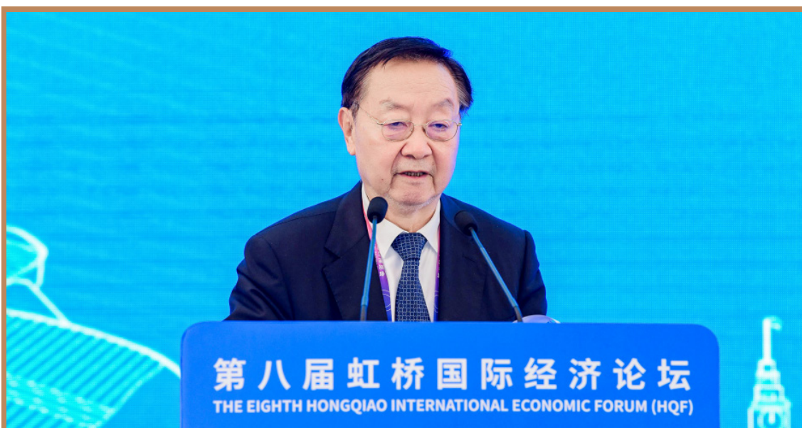
Li Yizhong, president of the China Federation of Industrial Economics and former minister of the Ministry of Industry and Information Technology, attended the parallel session on "Compliance and Sustainable Development for Global Manufacturing" and delivered a keynote speech