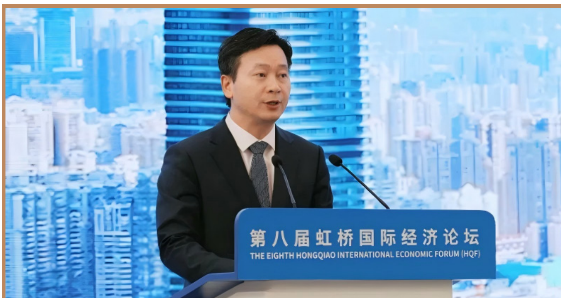
Wu Jingcheng | Deputy Secretary-General of the Shanghai Municipal Government, Deputy Secretary of the CPC Pudong New Area Committee, and District Mayor of Pudong New Area Attended the parallel session themed "Pudong and the World: Forging a Path to Openness, Shaping a New Industrial Landscape" and delivered a keynote promotion speech.