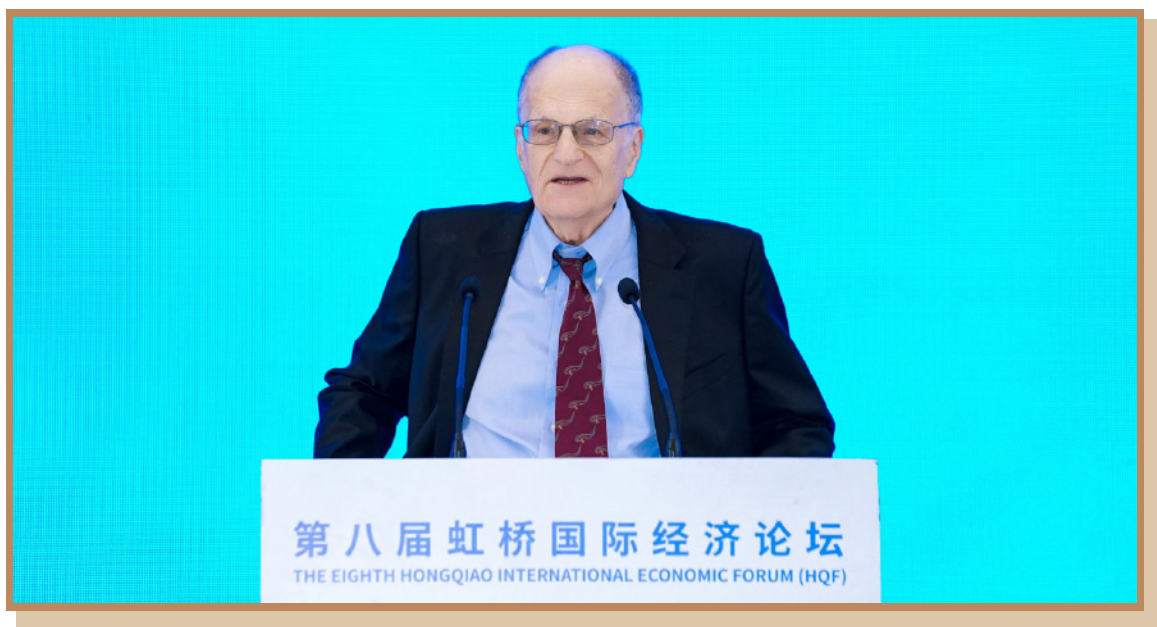
Thomas J.SargentRemarks | Nobel Laureate in Economics in 2011,Professor of New York University Attended the parallel session themed "Pudong and the World: Forging a Path to Openness, Shaping a New Industrial Landscape" and delivered a keynote speech