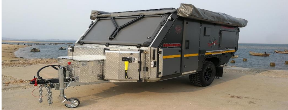
Picture 16: Product Diagram of Conqueror 490 Off-road Travel Trailer