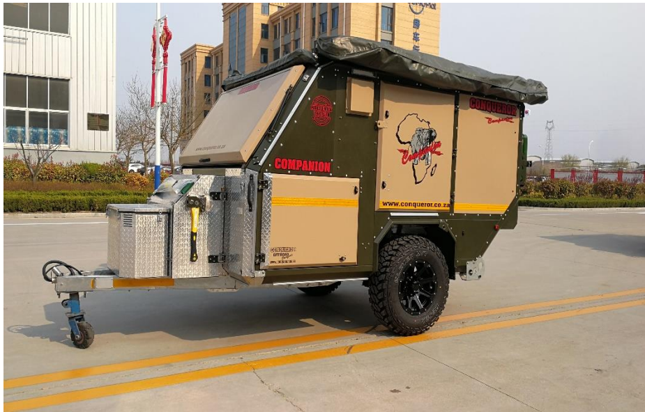
Picture17: Product Diagram of Conqueror 460 Off-road Travel Trailer

It was first introduced into China in 2020.