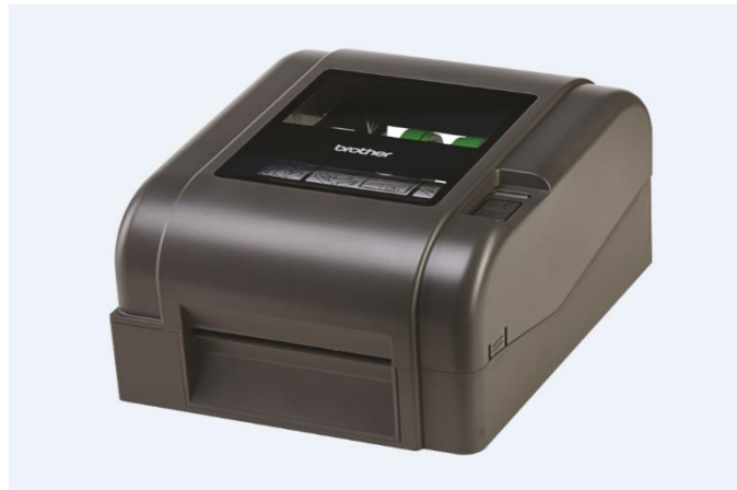
Picture 7: Product Diagram of Thermal Transfer Barcode Label Printer TD-4420TN

It is used for transfer barcode printing, with print speeds up to 6ips, 203 dpi print resolution, 108 mm print width. It supports printer command FBPL-EZD (EPL, ZPL, ZPL2, DPL) and such ports as USB, USB HOST, Wired, and Serial.