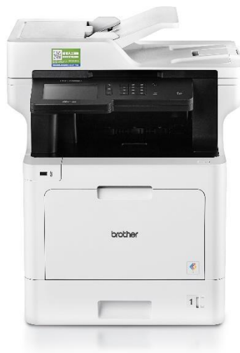
Picture 9: Product Diagram of All-in-One Color Laser Printer MFC- L8900CDW

MFC-L8900CDW wins the iF Design Award and enjoys 31ppm output in both color and monochrome plus 5.0" TFT Color LCD. It features wired and wireless network functions. 3 × 250-sheet capacity paper trays or 2 × 500-sheet capacity paper trays are optional.