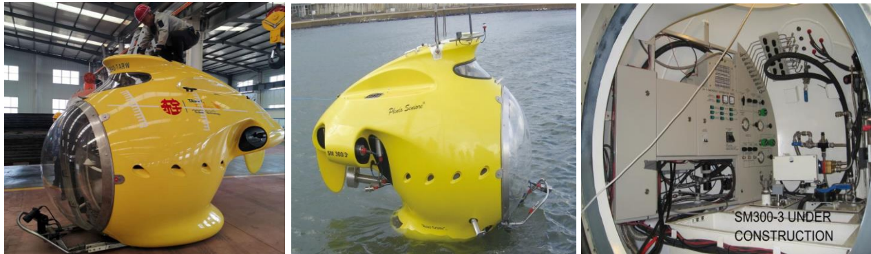
Picture 11: Product Diagram of the Multifunctional Submersible Vehicle

smooth diving and floating. Furthermore, the 4 high-performance underwater propellers equipped on the submersible vehicle ensure the underwater precise control.