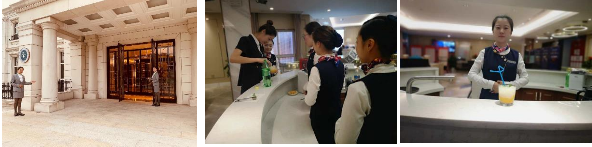
Pictures 4, 5 and 6: Advertising Diagrams of Sales Center Full Management