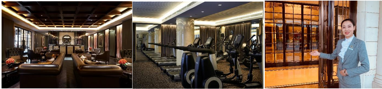
Pictures 1, 2 and 3: Advertising Diagrams of Community Club Consultant & Management Services

The Service Scope: Club Positioning, Floor Plan Design, Engineering Consultancy for Preparatory Projects, Pre-opening Preparation, Staff Recruitment & Training, Equipment Maintenance & Management, Membership Sales and CRM System Establishment. The services can be provided until the full opening and operation of the clubs.