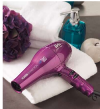
Pictures 67 and 68: Advertising Diagram of Solis 440 High Power Hair Dryer