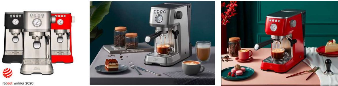
Pictures 59~61: Advertising Diagrams of Solis 1170 Italian Semi-automatic Small Household Coffee Machine

PID temperature control Product size: 18.7 * 37 * 32 cm.