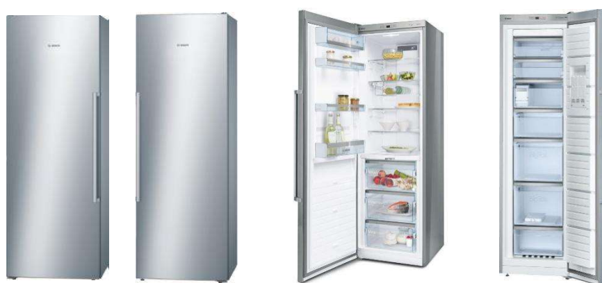
Pictures 19~22: Product Diagrams of Bosch · Imported Double Stainless Steel Refrigerator

The product is originated in Spain. Thereinto, the KSF36P133C is the cold storage-only refrigerator with a volume of 300 L, and the GSN36A133C is the refrigeration-only refrigerator with a volume of 242 L. The set of refrigerators can be combined and installed freely and flexibly; the separate refrigerating systems of different usages can make refrigeration faster and accurately control the temperature; the full air-cooled refrigeration method can free users from defrosting worries; the zero-degree Vita fresh room is equipped to accurately control the temperature and humidity; in addition, numerous user-friendly configurations such as the folding tray, partitions that can be drawn easily, the bottle holder that can be adjusted easily, as well as the ice machine are also equipped.