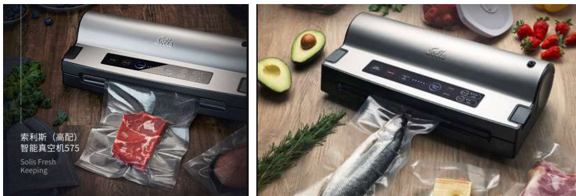
Pictures 62 and 63: Advertising Diagrams of Solis 575 Vacuum Sealing Machine

It is designed with the brushed stainless steel body, a LCD touch screen, the functions of automatic sealing and semi-automatic sealing, a built-in storage tank and a bag cutter.