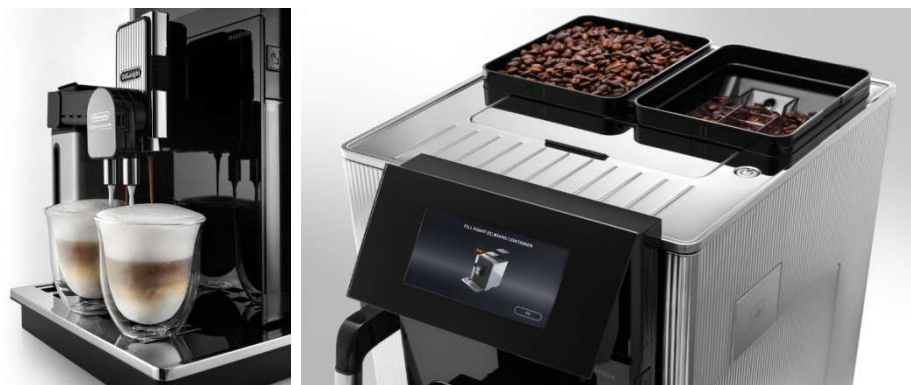
Pictures 36 and 37: Advertising Diagrams of De'Longhi Fully Automatic Coffee Machine Maestosa EPAM960.75

Accessories: 5.5-inch supersize TFT color screen, intelligent one-button production system, bluetooth connection, double bean warehouse design (each bean warehouse is equipped with a special grinder), bean grinding induction technology, double-flow outlet design (producing 2 cups of milk coffee at the same time), stirring and mixing container, and mirror design (front of the body).