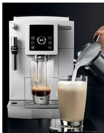
Pictures 38 and 39: Advertising Diagrams of De' Longhi Fully Automatic Coffee Machine ECAM23.420.W