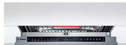
Pictures 23~25: Product Diagrams of Water Kinetic Energy Series VIII Embedded Dishwasher