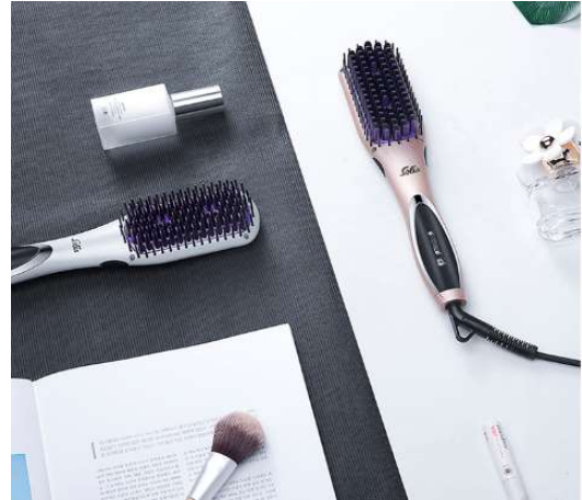
Picture 66: Advertising Diagram of Solis HS99 Anion Comb for Straight Hair—3D heating comb

It is famous for the ceramic tourmaline anion hair care technology, and 2,300 W high-power motor for rapidly drying hair.