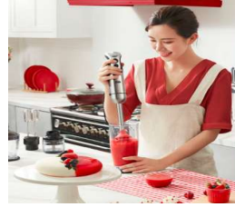
Pictures 64 and 65: Advertising Diagrams of Solis 830 Multi-functional Food Stick