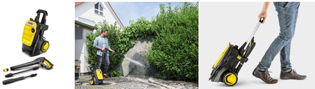
Pictures 56~58: Advertising Diagrams of Household High-pressure Cleaning Machine

As a star product, it is imported from Europe and won the German Design Award 2020. High tech water-cooled induction motor + double-layer composite pump body (motor pump invention patent: ZL 201180072870.4). Cool and novel appearance (appearance patent: ZL 2018 3 0508747.7). Fan-shaped stepless pressure regulating spray gun + spiral high-pressure blasting gun (double gun configuration), maximum pressure: 145 bar, maximum water flow: 500 L/h, power: 2,100 W.