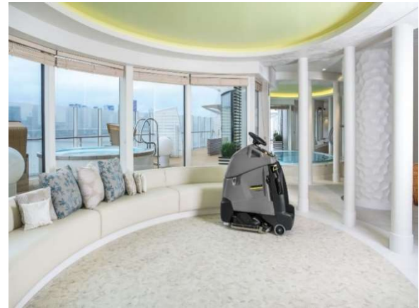
Picture 53: Advertising Diagram of Intelligent Washing Machine BD 50/40 RS Robot