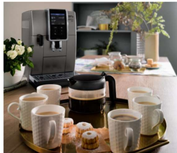
Pictures 34 and 35: Advertising Diagrams of De' Longhi D9 T Fully Automatic Coffee Machine