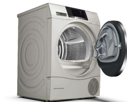
Pictures 26 and 27: Product Diagrams of Series VIII Imported Heat Pump Clothes Dryer