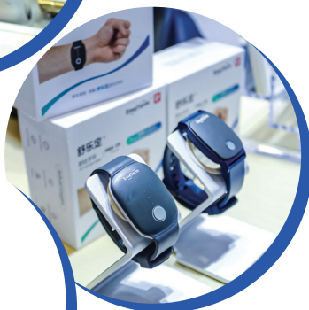
Future Shock Award WAT Med-EmeTerm neuro-modulatory wearable and treatable device