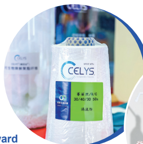
Most Popular Award INTIMITI AUSTRALIA PTY LTD-SELYS