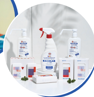
Most Popular Award Intrado Tech Venture Limited-Bacolab