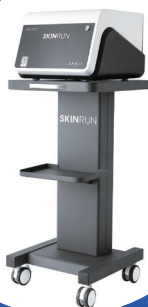
Future Shock Award SKINRUN