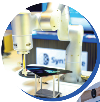
Future Shock Award Flexiv Ltd