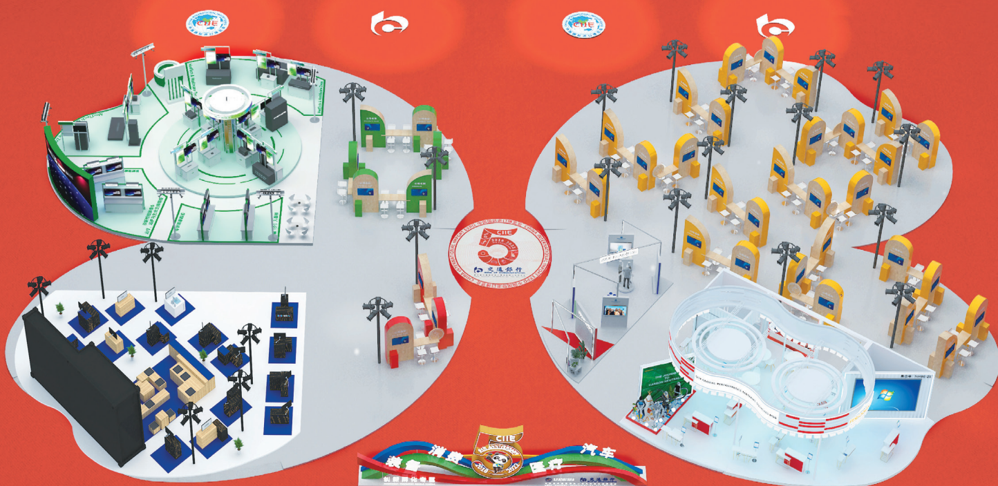
Design sketch of Innovation Incubation of the 5 th CIIE