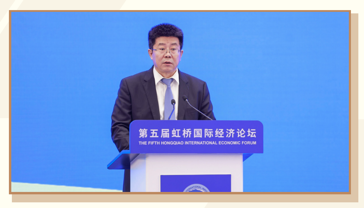
Gu Xueming, President of Chinese Academy of International Trade and Economic Cooperation, Ministry of Commerce, attended the Press Conference on World Openness Report 2022 & International Symposium on Current Situation and Prospects of World Openness and participated in the result release via video.

Gu Xueming, President of Chinese Academy of International Trade and Economic Cooperation, Ministry of Commerce, highlighted China's achievements in the past decade of opening-up and its contribution to the world, which mainly reflected in: The steady progress made in the high-quality development of foreign trade, the two-way investment being raised, the improvement of the new system of the open economy, and the contribution made by China's opening-up to the development of the world economy. Overcoming global challenges requires true global cooperation. China has been committed to opening-up to the outside world. It has promoted global opening-up and cooperation through international exhibitions such as the CIIE, the Belt and Road Initiative, and the Global Development Initiative, so as to provide more public goods and platforms for international cooperation and contribute Chinese wisdom and solutions to improving global governance.