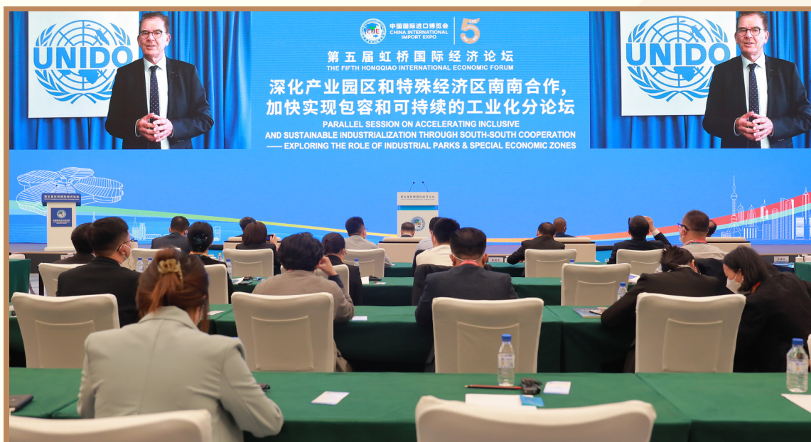
Gerd Müller, Director General, United Nations Industrial Development Organization (UNIDO), attended the Parallel Session on Accelerating Inclusive and Sustainable Industrialization through South-South Cooperation--Exploring the Role of Industrial Parks and Special Economic Zones online and delivered a speech.

Gerd Müller, Director General, United Nations Industrial Development Organization (UNIDO), pointed out that China's rich experience in the construction and development of industrial parks at present has positive reference significance for other developing countries. Under the current situation, it is necessary to promote investment in infrastructure and innovation and accelerate industrialization, digitalization, and green transformation. UNIDO regards industrial parks as a "comprehensive tool to support sustainable industrialization", and provides a series of services, including technical support, policy consultation, knowledge and technology transfer, and development normative tools to member countries through various channels such as South-South and tripartite cooperation, supporting the standardization of industrial parks and continuously promoting industrial parks to become the source of industrial and technological innovation.