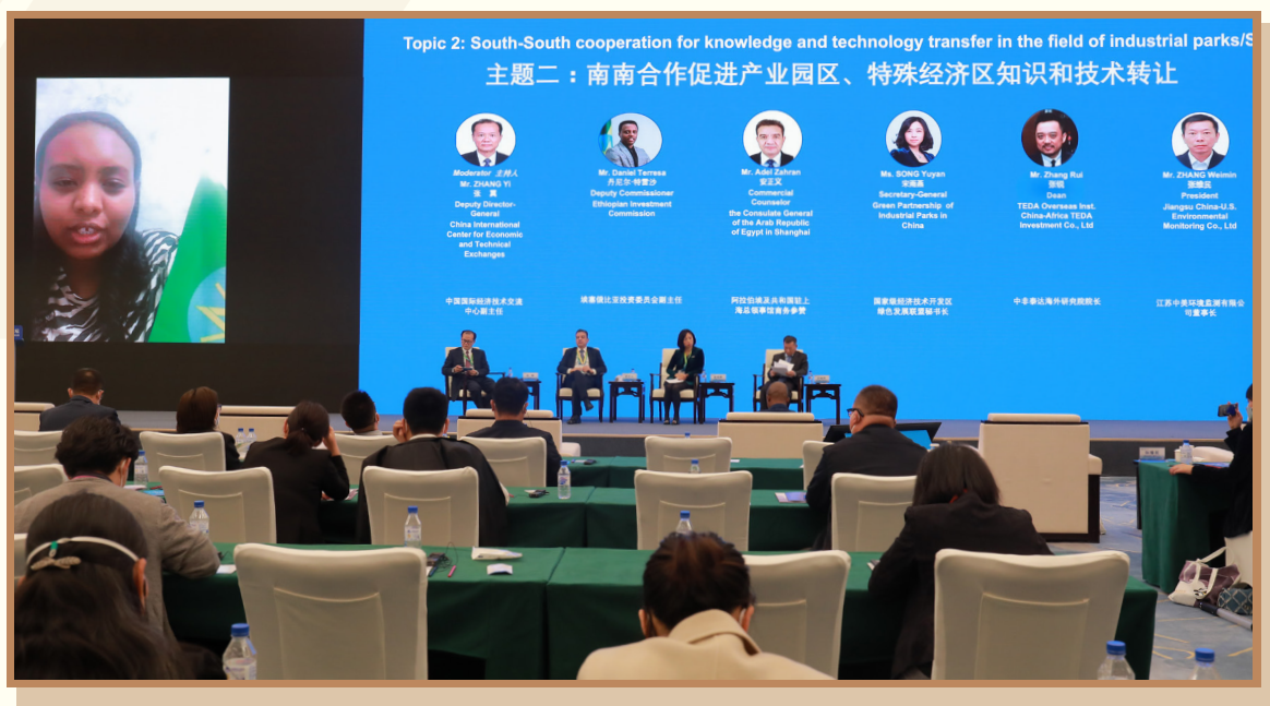
Lelise Neme, Commissioner, Ethiopian Investment Commission, attended the Parallel Session on Accelerating Inclusive and Sustainable Industrialization through South-South Cooperation-- Exploring the Role of Industrial Parks and Special Economic Zones and participated in interactive discussions.

Lelise Neme, Commissioner, Ethiopian Investment Commission, said that in the past few years, Ethiopia has established a series of cooperation in parks in special economic zones, which has improved the level of infrastructure construction. Meanwhile, industrial parks have strengthened their specialized fields, such as textile, agricultural products, and light industry. Ethiopia has made some achievements in special economic zones, creating 100,000 employment opportunities, and the park has also played a positive role in technology transfer, including knowledge sharing.