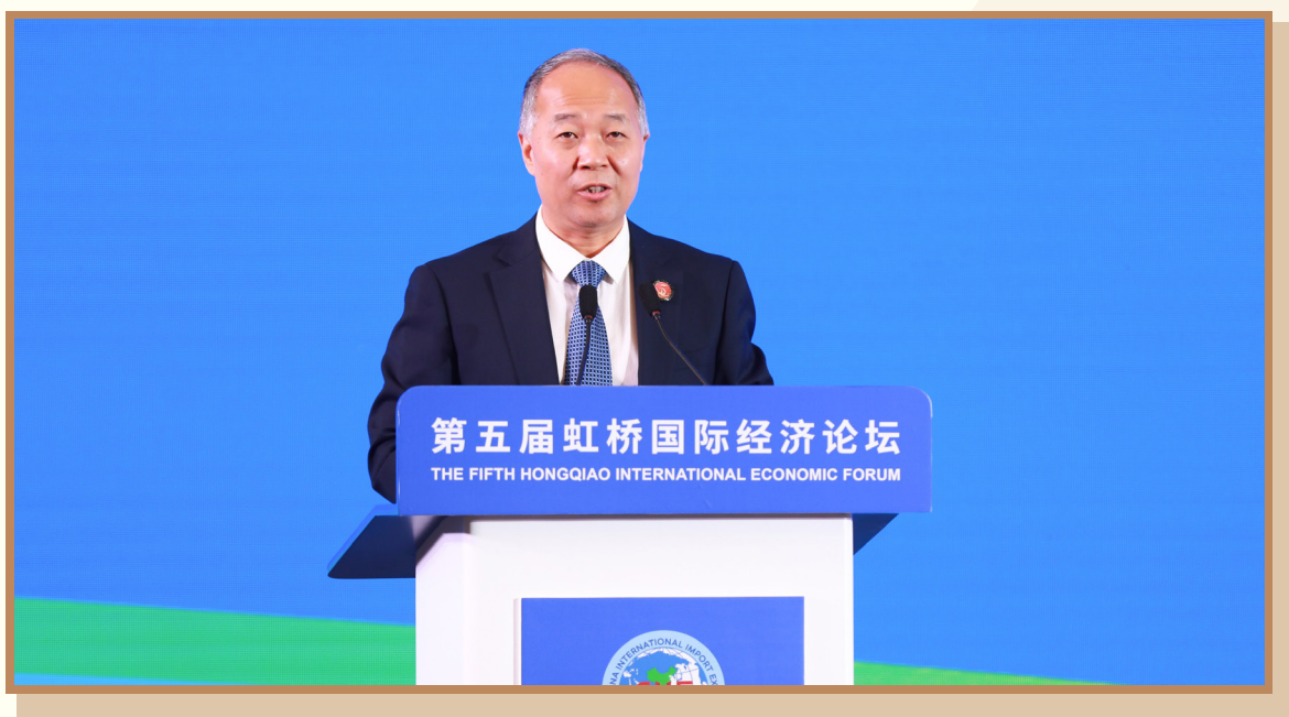
Ma Youxiang, Vice Minister of the Ministry of Agriculture and Rural Affairs of the People's Republic of China, attended the Parallel Session on Economic and Trade Cooperation for Global Food Security and Rural Revitalization in Shanghai and delivered a keynote speech.

Ma Youxiang, Vice Minister of the Ministry of Agriculture and Rural Affairs of the People's Republic of China, pointed out that on the 20th National Congress of the Communist Party of China, the Communist Party of China drew a grand blueprint for modernization with Chinese characteristics, put forward the important task of moving faster to build up China's strength in agriculture, and defined the main direction of agricultural and rural modernization in the new era and new journey. China attaches great importance to food security and rural revitalization, and its grain production capacity has reached a new level. It has been stable at over 650 million tons for seven consecutive years, and the rice bowls of more than 1.4 billion people are firmly secured in their hands. At present, the world has entered a new turbulent change period, and many new problems emerge in global food security and rural construction. China has always insisted on expanding agricultural trade and deepening investment cooperation, pursuing multilateralism and humanitarianism, promoting food security and rural revitalization with high-level economic and trade cooperation, and sharing development opportunities with the world.