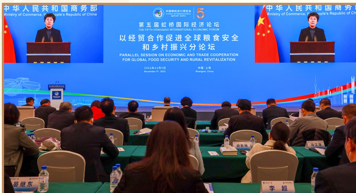
Guo Tingting, Vice Minister of the Ministry of Commerce of the People's Republic of China, attended the Parallel Session on Economic and Trade Cooperation for Global Food Security and Rural Revitalization in Shanghai and delivered a keynote speech.

Guo Tingting, Vice Minister of the Ministry of Commerce of the People's Republic of China, pointed out that China has always regarded food security as the top priority, serving an important contributor to global food security, an active promoter of international food cooperation and a firm defender of world food security governance. At present, the global food industry chain and supply chain are facing unprecedented challenges. Maintaining global food security requires the international community to work together. With the efforts of all parties, the clear goal of hunger eradication in the United Nations 2030 Agenda for Sustainable Development will surely be achieved.