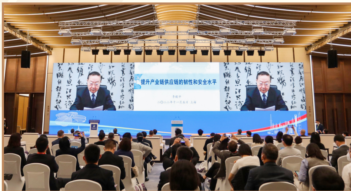
Li Yizhong, President, China Federation of Industrial Economics, attended via video link the Parallel Session on Advancing Supply Chain Sustainability through Cooperation on Corporate Social Responsibility in Shanghai and giving a keynote presentation.

Focusing on the topic: Improving the resilience and security of industrial chains and supply chains, Li Yizhong, President, China Federation of Industrial Economics, asserted that the understanding of the connotation of industrial chains and supply chains should be deepened, new challenges and tasks for industrial chains and supply chains amid global upheavals and domestic dynamics as China is moving into a new stage should be actively responded to, and the resilience and security of industrial chains and supply chains should be enhanced. As a result, enterprises should not only forge and strengthen the whole systems of industrial chains and supply chains but also should make more effort to make them green, low-carbon and digitalized so as to ensure their security and stability and enhance their strength and resilience, which is a new corporate social responsibility for all enterprises in the context of drastic social changes and in a new stage of economic growth.