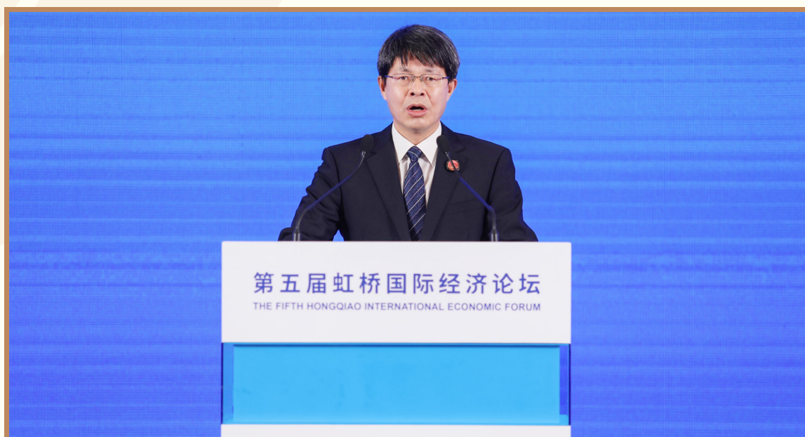
Zhang Yunming, Vice Minister of the Ministry of Industry and Information Technology of the People's Republic of China, attended and addressed the Parallel Session on Advancing Supply Chain Sustainability through Cooperation on Corporate Social Responsibility in Shanghai.

Zhang Yunming, Vice Minister of the Ministry of Industry and Information Technology of the People's Republic of China, pointed out that as the world is moving into a turbulent and transforming period, unprecedented challenges are cropping up to global industry chains and supply chains, and to maintain their smooth, steady and reliable operation is not only a critical precondition for sustainable development but also an important content and an integral component of corporate social responsibility under the new circumstances. China is willing to work together with governments and enterprises of all countries in grasping new opportunities amid the ongoing technological revolution and industry transformation to advance the green and low-carbon development of global industry chains and supply chains, enhance their resilience and stability, and foster new impetuses for sustaining their growth, making them more reliable, smooth, efficient, inclusive and mutually beneficial to all parties through concerted efforts and contribute more to the global growth and the welfare of all peoples. It is China's sincere hope that all parties strengthen their communications and exchanges, build their consensus and work together to build up more secure, robust and unblocked global industry chains and supply chains.