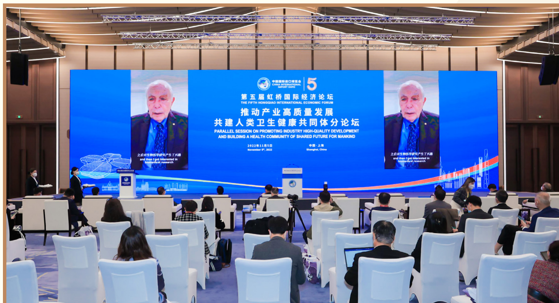
Avram Hershko, 2004 Nobel Laureate in Chemistry, Member of Israel Academy of Sciences and Humanities, Foreign academician of Chinese Academy of Sciences (CAS), attended via video link the Parallel Session on Promoting Industry High-quality Development and Building a Health Community of Shared Future for Mankind in Shanghai and giving a keynote presentation.

Avram Hershko, 2004 Nobel Laureate in Chemistry, Member of Israel Academy of Sciences and Humanities, Foreign academician of Chinese Academy of Sciences(CAS), held that basic research is central to all important innovations in the pharmaceutical industry. The remarkable improvement in human health over the past 50 years or so may largely be credited to great innovations in pharmacy, biotechnology and biomedical instrumentation, and major discoveries in the basic biomedical sciences. Yet, in the long run, innovation always relies on advance in basic research. That is, basic research is a long-term social investment in technological innovation. Therefore, to have highly original innovations in the industry, our society should support high-quality basic research.