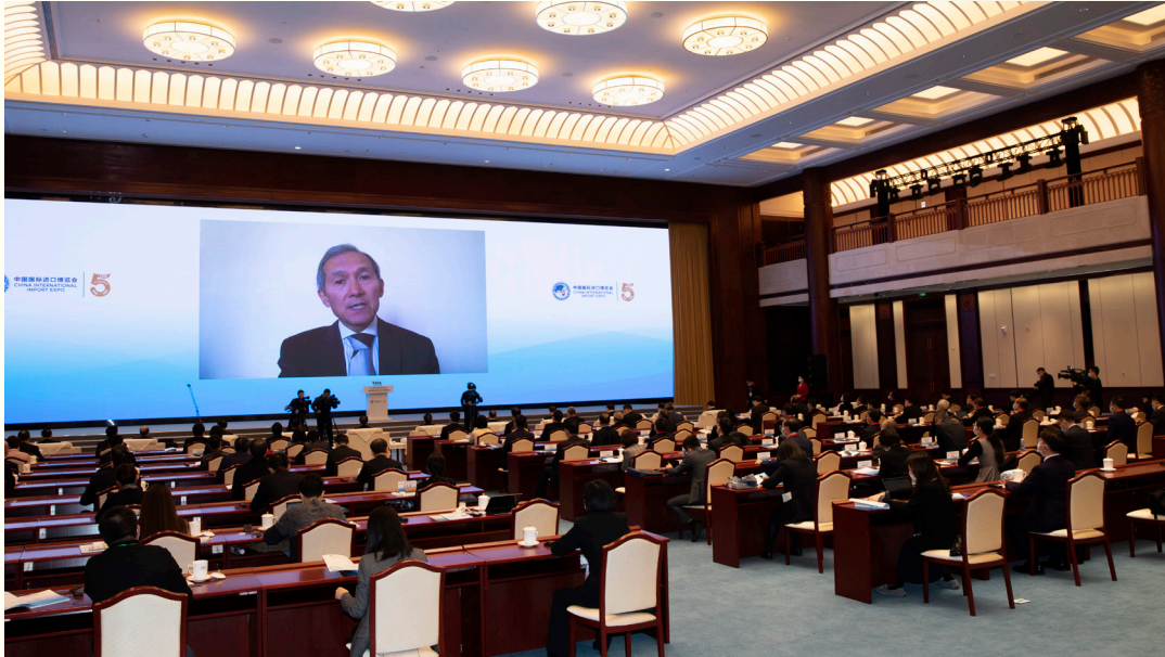
Djomart Otorbaev, Former Prime Minister of Kyrgyzstan, attended the Parallel Session on New Prospects for China and New Opportunities for the World and delivered a speech via video.