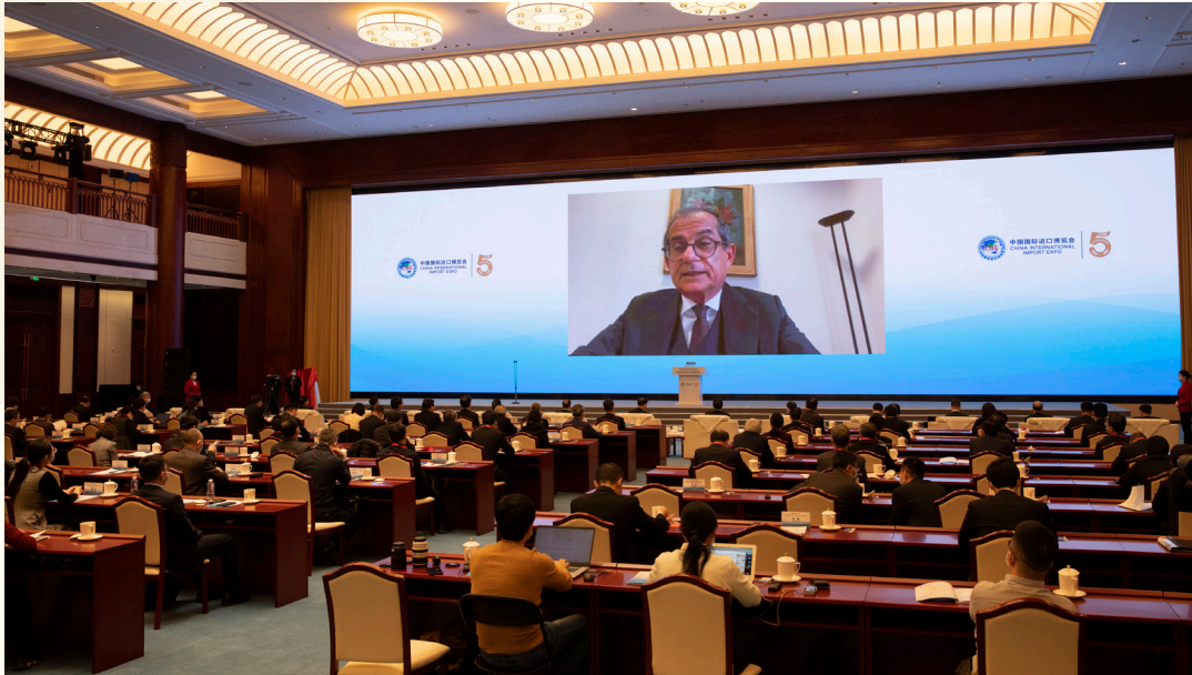
Giovanni Tria, Former Italian Minister of Economy and Finance; Former President of the National School of Administration of Italy, attended the Parallel Session on New Prospects for China and New Opportunities for the World and delivered a speech via video.