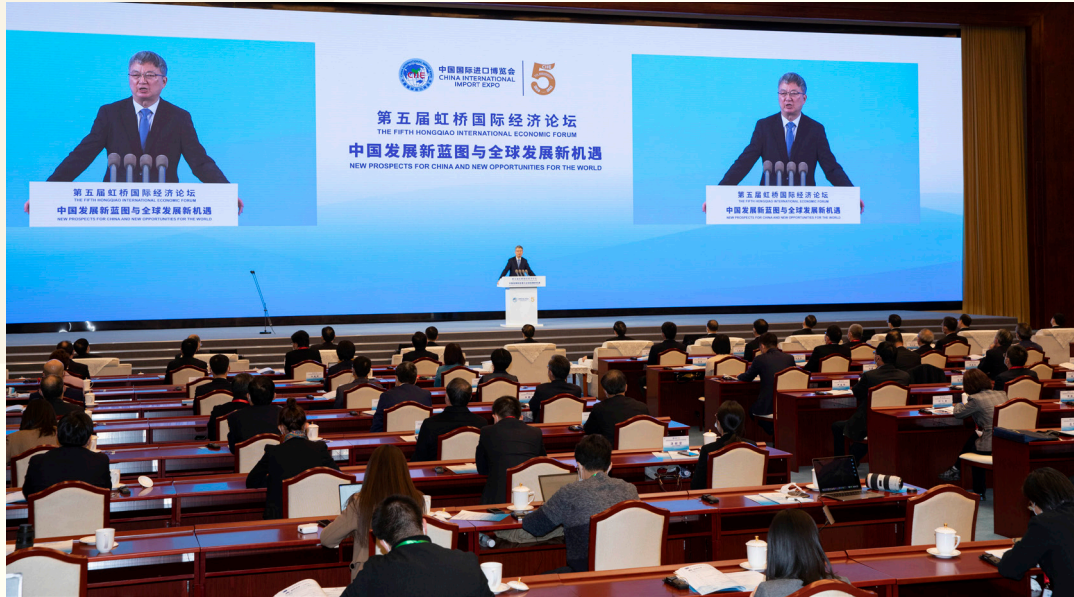
Zhu Min, Vice Chairman of China Centre for International Economic Exchanges; Former Deputy Governor of the People's Bank of China, attended the Parallel Session on New Prospects for China and New Opportunities for the World and delivered a speech in Beijing.