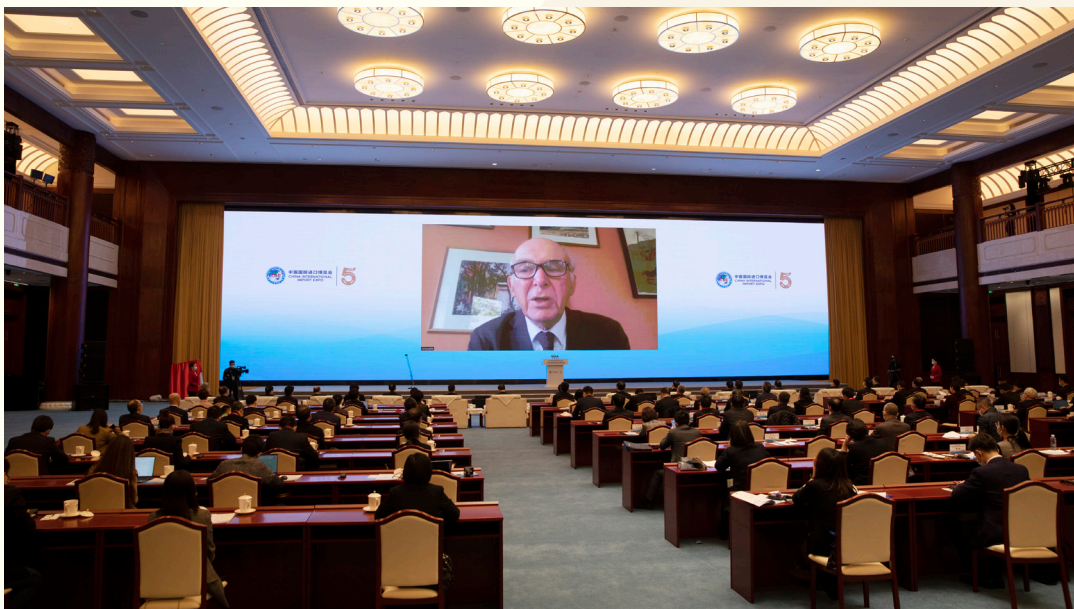
Vince Cable, Former Secretary of State for Business Innovation and Skills and President of the Board of Trade, UK, attended the Parallel Session on New Prospects for China and New Opportunities for the World and delivered a speech via video.