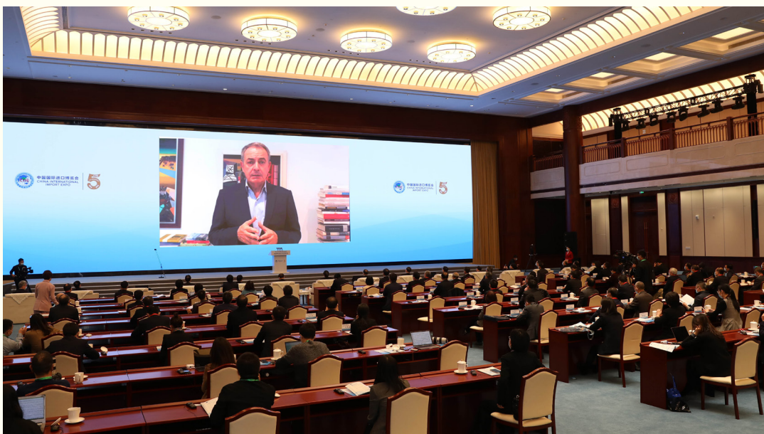
Jose Luis Rodriguez Zapatero, Former Prime Minister of Spain, attended the Parallel Session on New Prospects for China and New Opportunities for the World and delivered a speech via video.